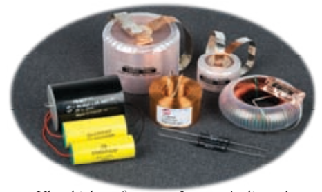
Ultra high performance Jantzen Audio and Kimber Kap crossover components for ultimate fidelity.