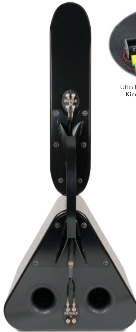
The unique connection bracket not only dampens vibrations, it features a channel for discreet wiring. (optional Kimber Kable harness shown)