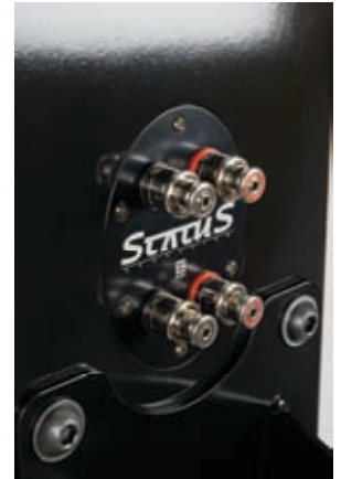
Dual WBT® wiring terminals on each cabinet guarantee secure connections and wiring flexibility.