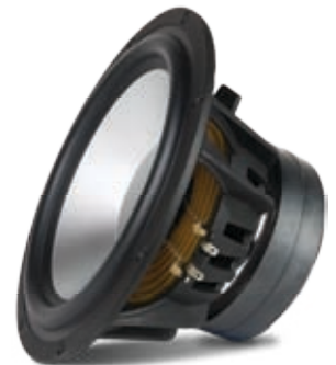
Three 10-inch high performance subwoofers with 100 oz. Strontium magnets per side.